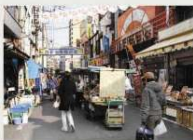
Nishijin Market Street

There are shared kitchens in the dormitory, so participants can cook themselves. Just under ten minutes on foot, they will be able to buy groceries at the Nishijin or Fujisaki Market Street. There are also many restaurants, pubs, and grocers in these areas offering a wide range of cuisines from many countries. Students can also have meals at two on-campus cafeterias at reasonable prices.