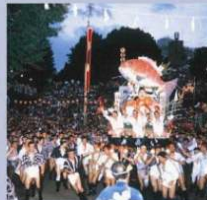
Hakata Gion Yamakasa Festival