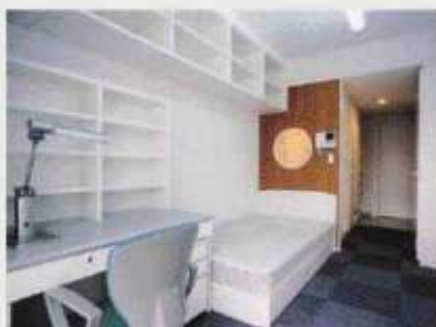
Comfortable Single Room