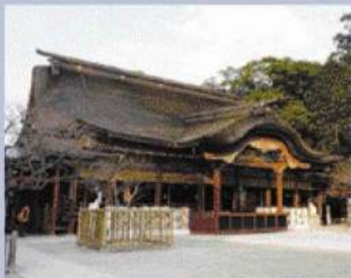
Dazaifu Tenmangu Shrine

We have included in a lot of activities for classes doing things which you can only experience in Japan. For example, simpler tasks for refresher (beginning II) level students might be just to go to some shop and find out if they have a particular item and, if so, how much it costs. More advanced students might be interviewing Japanese students, or searching around for local landmarks. The aim in all of this, of course, is to give students an opportunity to experience the pleasure not only of communication in Japanese, but of actually accomplishing something. From both these will grow both confidence and competence in the Japanese language. This makes the language more than just a classroom subject; it makes it a part of the students' life experiences. It is meant to be a lot of fun, even if it may seem trying at times.