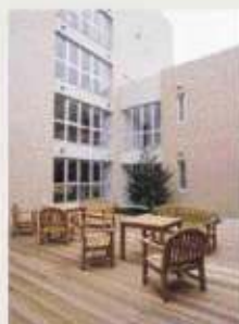
Spacious Wood Deck